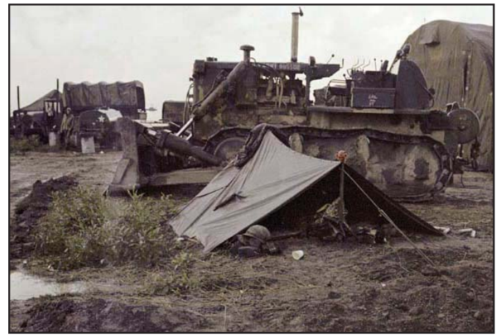
7:30 to 10:30pm and then went to bed. It started raining during the early morning hours. It was getting cold and a typhoon was moving in.

Finally pulled out of Chu Lai about 9:30am. Arrived at our new location, Hoi An - Hill 63 (LZ Baldy), and began to set up camp. It would only be temporary till we moved out of the perimeter and got our new homes built. Smity and I put up 3 ponchos. Had guard from